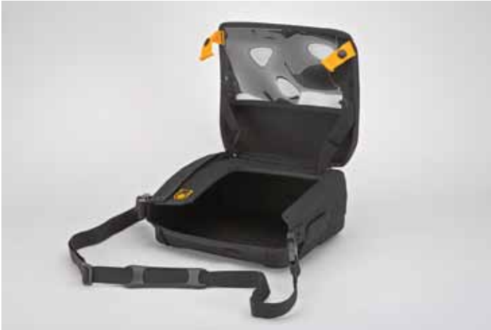
Complete Soft Shell Carrying Case 11998-000014

AED Professionals is a Certified Authorized Medtronic-Physio Control Dealer. Please call 1-888-541-2337 or visit us at www.aedprofessionals.com to buy your Lifepak 500 Accessories