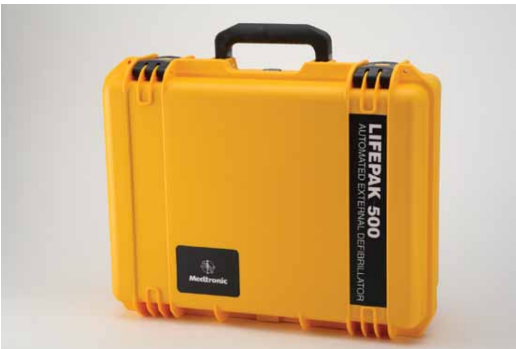
Hard Shell, Water-tight Carrying Case 11998-000021