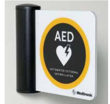
AED Location Sign T-mount, 8" x 8", with logo 11210-000031